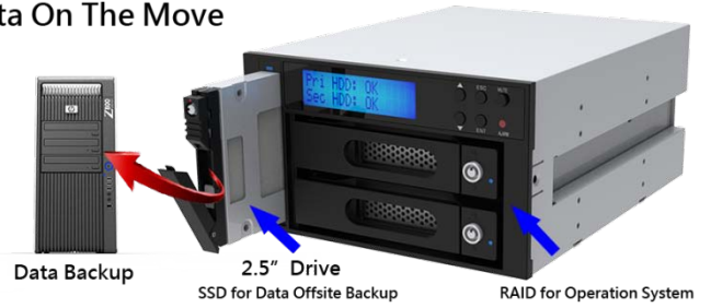
(2) RAID for Operation System + Additional SSD for Data Offsite Backup