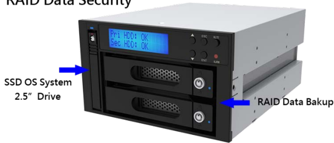
(1) 2.5" SSD OS System + RAID Data Backup