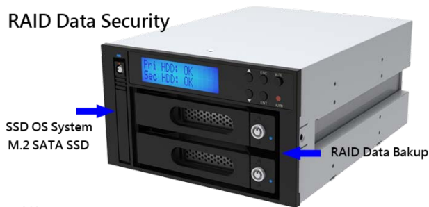
(1) M.2 SATA SSD OS System + RAID Data Backup