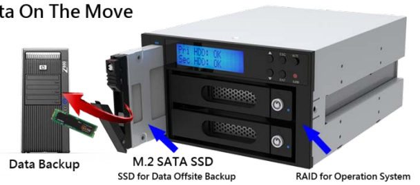
(2) RAID for Operation System + Additional M.2 SATA SSD for Data Offsite Backup