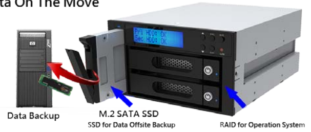
(2) RAID for Operation System + Additional M.2 SATA SSD for Data Offsite Backup