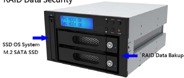
(1) M.2 SATA SSD OS System + RAID Data Backup